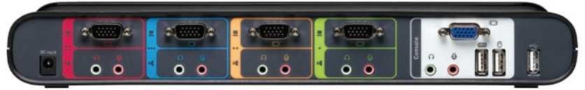
Model depicted above is F1DS104Lea.