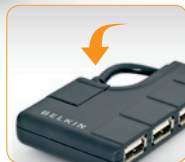
With integrated cable slot