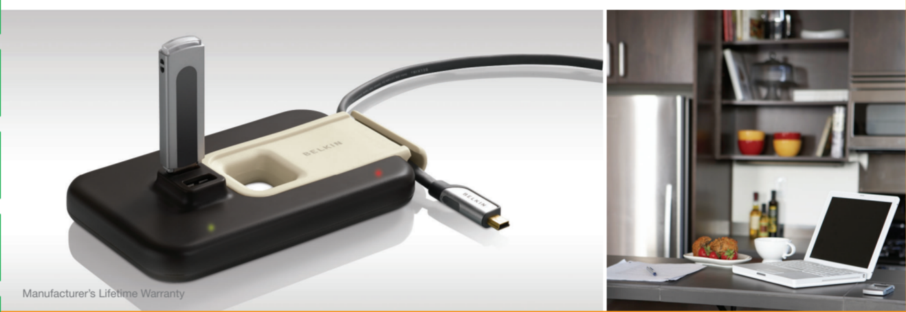
Manufacturer's Lifetime Warranty