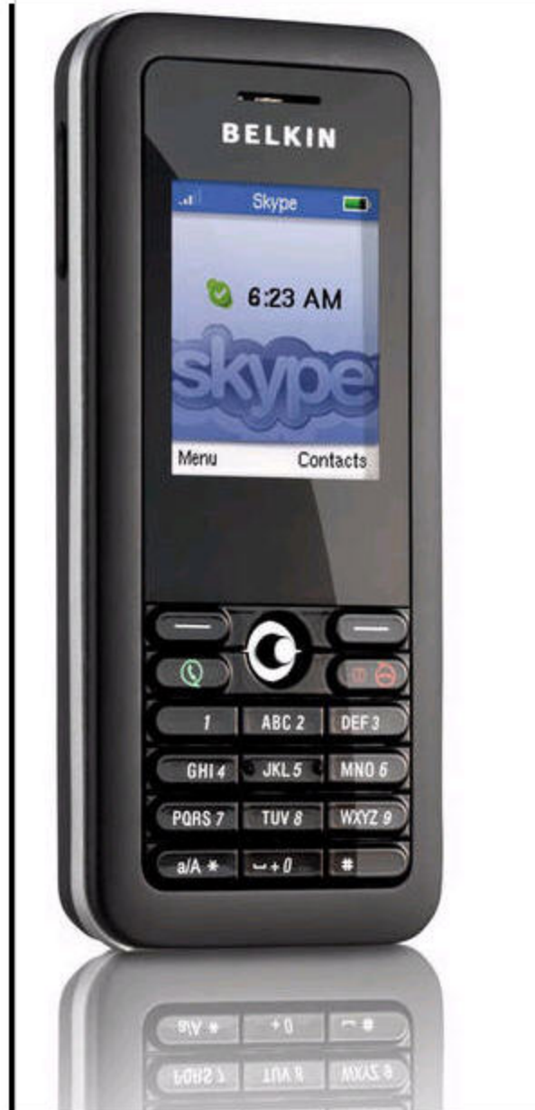
Belkin Wi-Fi Phone

Watch this episode of Digital Journal TV to learn more.