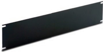
2U Filler Panels (set of 2) RK5032ek

Fill empty rack spaces and direct airflow with our filler panel kits.