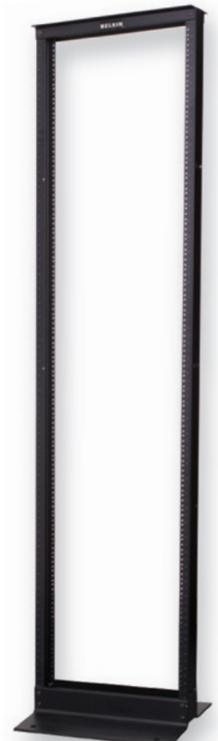
RK2000ek 2-Post Rack 45U