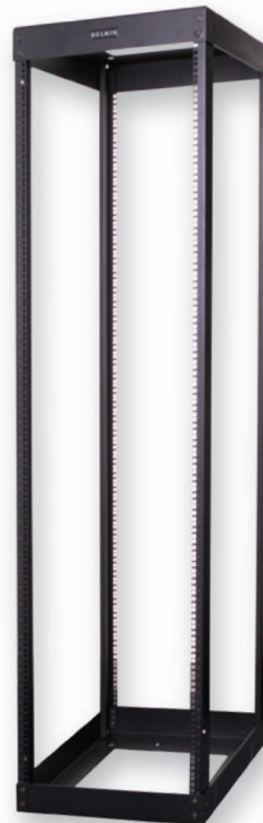
RK4000ek 4-Post Rack 43U