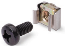
M6 Cage Nuts and Screws RK5034ek (for use with RK4000ek)

Mount and stabilise equipment with screws and anchor kits.