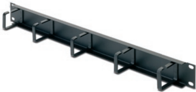
1U Horizontal Cable Manager RK5016ek

Route and organise cables between equipment. Available in single and doubled-sided versions and in various sizes.