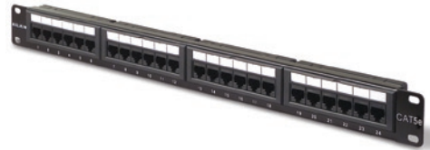
24-Port CAT5e Patch Panel F4P338-24-AB5

Patch and arrange LAN connections. Available in 12, 24, 48, 72 and 96 port versions.