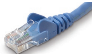
CAT5e Solid Horizontal Cable, 250M (not pictured) A7L504uk250M-BL

Reliably connect equipment with Belkin bulk and patch cabling.