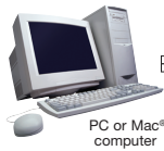
PC or Mac® computer